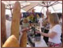
160 varieties of Colorado wine

Grand Tasting and a Winemaker Dinner $75.00 per person