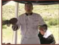
Demonstrations & delicious cuisine