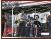
Live jazz music by MoDaZz