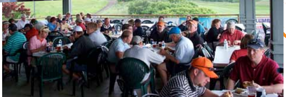
The 2009 Castle Rock Chamber Annual Golf Tournament participants enjoying a delicious BBQ lunch provided by Red Hawk Ridge Golf Course.