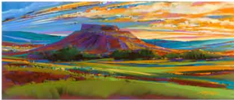
Twenty First Annual Castle Rock Artfest