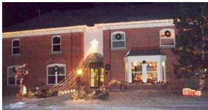
Castle Country Assisted Living received the Best Overall Decorations award in the Starlighting Decorating Contest. They are located at 221 Cantril Street.

Allstate Insurance - local agencies of Ellis, Dow, MacDonald and Lopez - Anniversary Sponsor Bubbles Liquor World - Spirit of the Season Sponsor FirstBank of Douglas County - Santa Sponsor